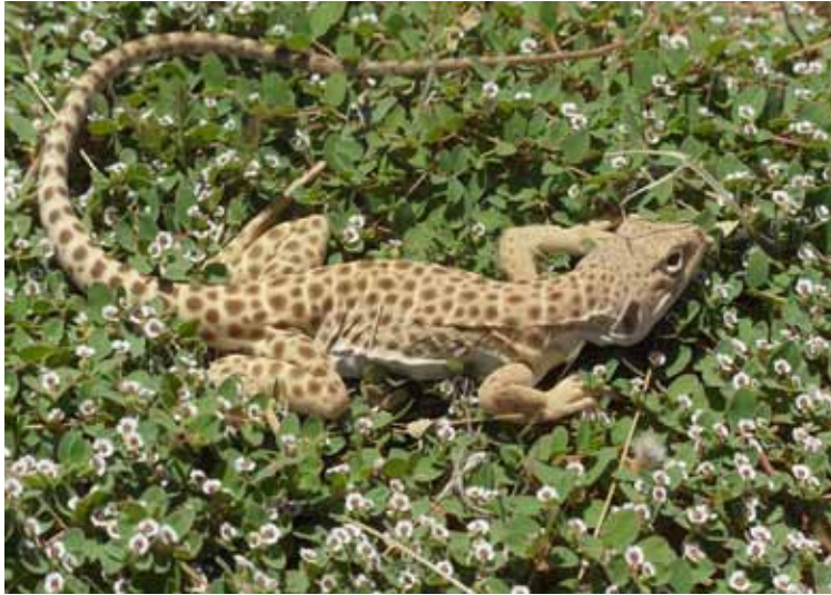
Long-nosed leopard lizard (Gambelia wislizenii) basking on a patch of rattlesnake weed (Chamaesyce albomarginata) in the western Mojave Desert.