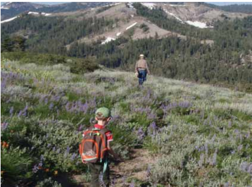
Somewhere in the Sierra