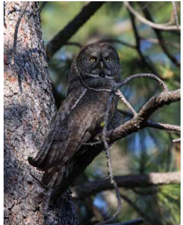
Male Great Gray Owl at about 2,700' elevation in El Dorado County.

An ebook version is available for about $5. Hardcopy is also available.