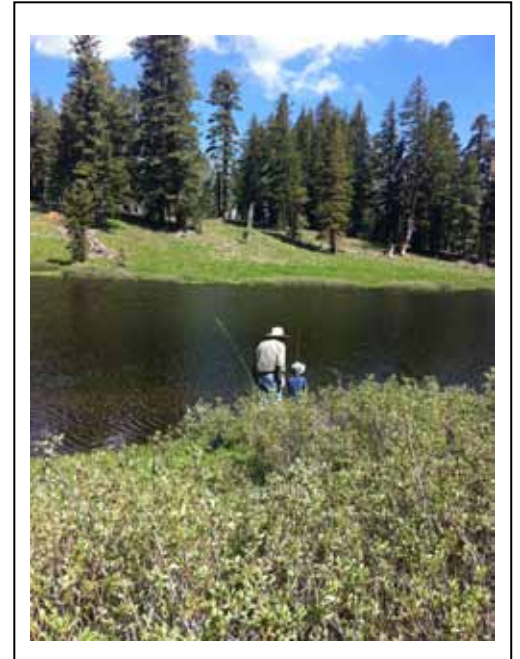
Ingraining a passion for the high Sierra