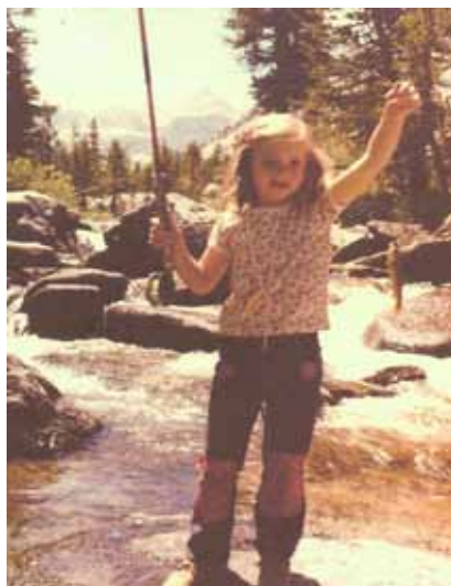
The beginning of my love for the outdoors, circa 1975

I suspect that you have heard many of these messages before so I won't repeat them. Instead, I