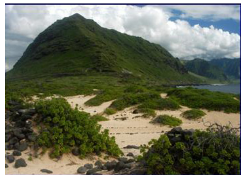
Kaena Point Natural Area Reserve

The Hawaii Chapter participated in the annual Hawaii Conservation Conference (HCC) in July, both through financial support of awards for best student presentation and best student poster, and the University of Hawaii Hawaiian Internship Program. Chapter members also helped organize the Conservation Opportunities and Career Fair at this year's HCC. The Chapter continues to sponsor a number of wildlife conservation projects throughout the state. The Chapter has continued participation as a partner with the Hawaii Department of Land and Natural Resources and the U.S. Fish and Wildlife Service in a cooperative effort to construct a predator-proof fence and remove all alien mammals within the proposed fence at the Kaena Point Natural Area Reserve on the island of Oahu (photo), and it is hoped that construction can begin early next year. Once completed, the project will create a 59-acre area of coastal habitat free from alien mammals, including feral dogs, cats, mongooses, and rodents.