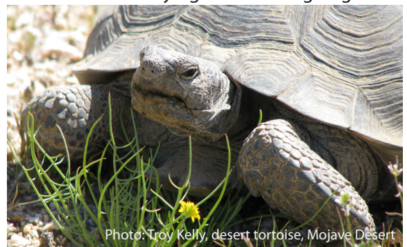
desert tortoise, Mojave Desert