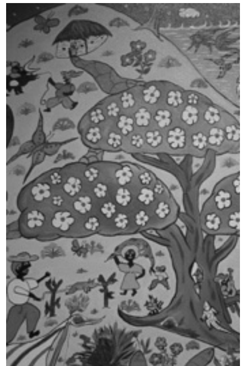
A sample of Cuban art; evidence of Cuba's influence on Miami is everywhere, including our hotel.