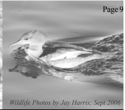
Wildlife Photos by Jay Harris; Sept 2006