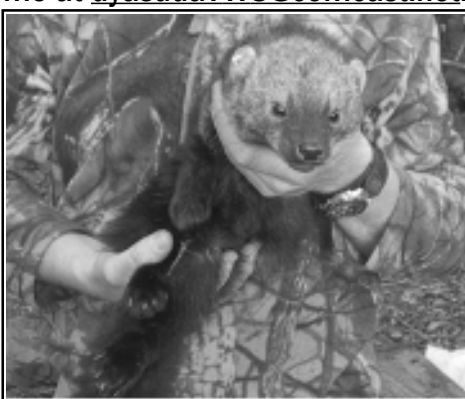
Fisher and Marten in California

As always, if you have questions regarding your membership status or have updated address and/or email information, please contact me at dyasudaTWS@comcast.net.